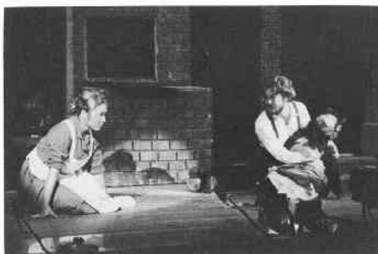
SWEENEY TODD (Keio)