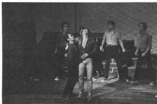
WEST SIDE STORY (Waseda)