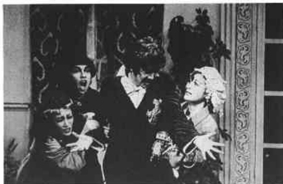
GOD'S FAVORITE (Hitotsubashi & Tsuda)