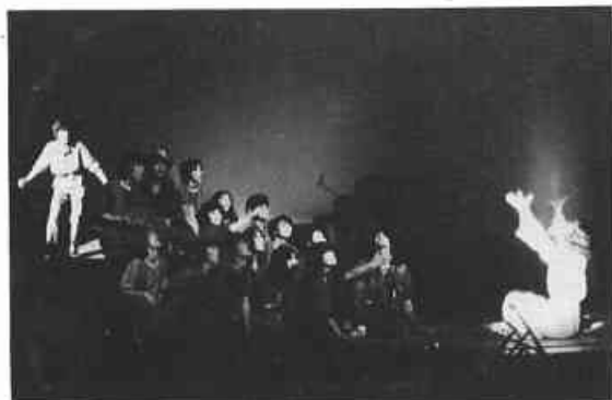
JESUS CHRIST SUPERSTAR (St. Paul's)