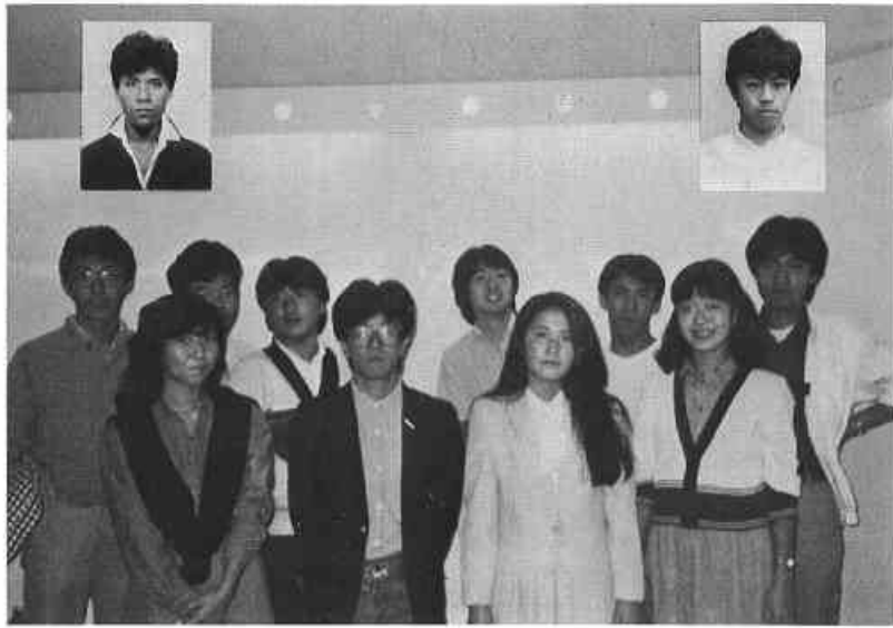
Four-University E.S.S. Association