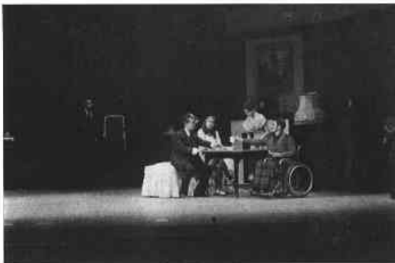
THE REAL INSPECTOR HOUND